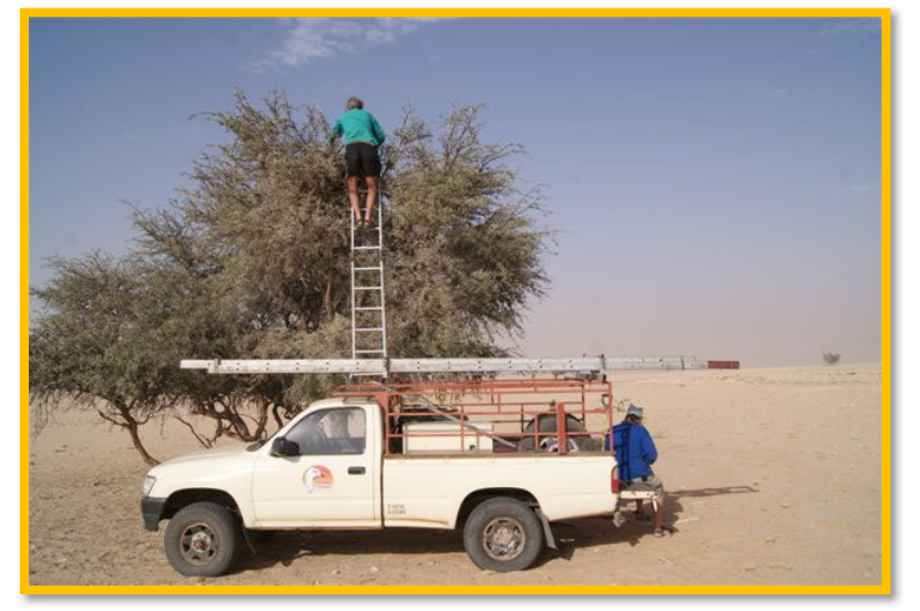
Climbing small tree to ring chick.

Although many vultures breed in national parks, game reserves and protected areas, they often feed on farms and communal areas. Here they become victims of the unrelenting struggle between farmers and predatory mammals attacking domestic livestock.