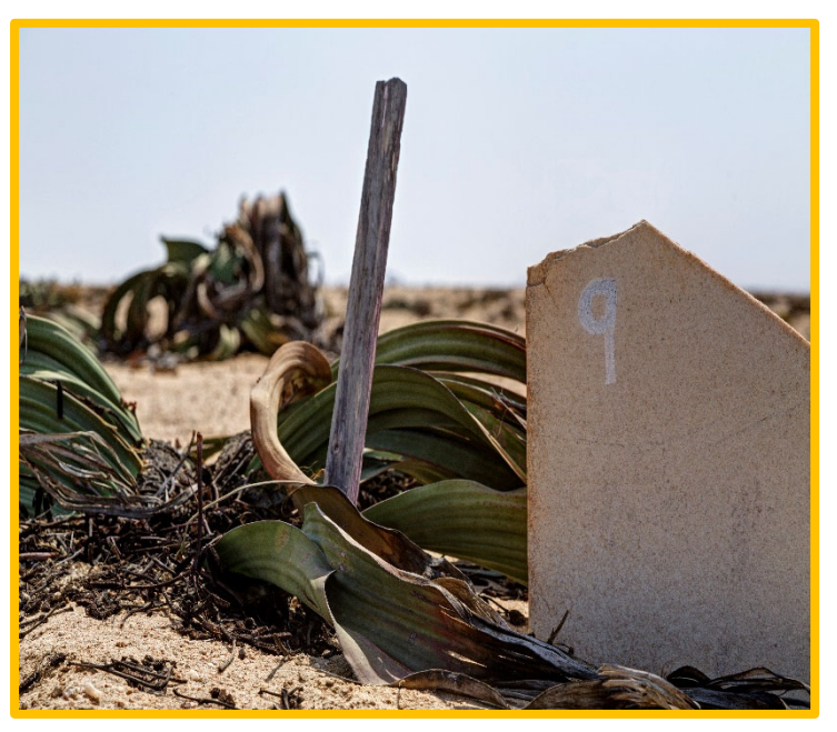
Welwitschia plant (number 9) as monitored.

Welwitschia mirabilis plants are unusual for their large, strap like leaves that grow continuously along the ground. The leaves have a unique structure that allows them to harvest moisture from night time dew in the desert. During its entire life, each plant produces only two leaves, which often split into many segments as a result of the leaves being whipped by the wind. Carbon-14 datings of the largest plants have shown that some individuals are over 1,500 years old with their leaves the longest-lived in the plant kingdom. Whilst neither endangered nor rare, nevertheless they are protected by law and feature on the Namibian Coat of Arms.