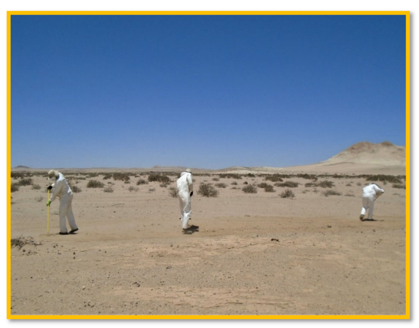
Raking the sand in rehabilitation.

The main access tracks do not undergo rehabilitation as these remain for future access to the main areas of activity so as not to create additional disturbances. Other tracks not shown as being rehabilitated remain for the near-term as they will be used for future drilling and then subsequently rehabilitated so as to cause minimal disturbance in the desert.