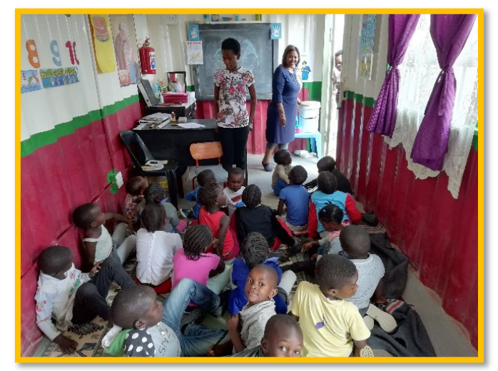
Classroom of the DRC kindergarten (before the pandemic).

Due to the outbreak of the COVID-19 pandemic, RMR assisted the kindergarten with disinfectant, sanitisers and other cleaning reagents to ensure that children could continue learning in a safe environment.