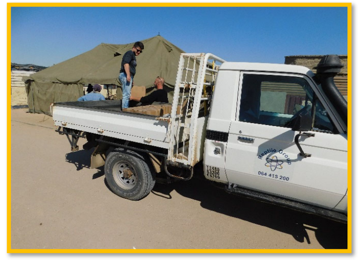
Distribution of food parcels in Swakopmund.