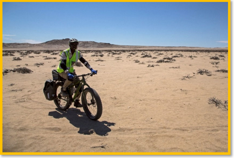
Fat bike traversing desert.

Fat bikes provide a comfortable drive in even sandy terrain and, by nature, have a very small footprint on the ground. Fat bike tracks are very light and easily rehabilitate themselves.