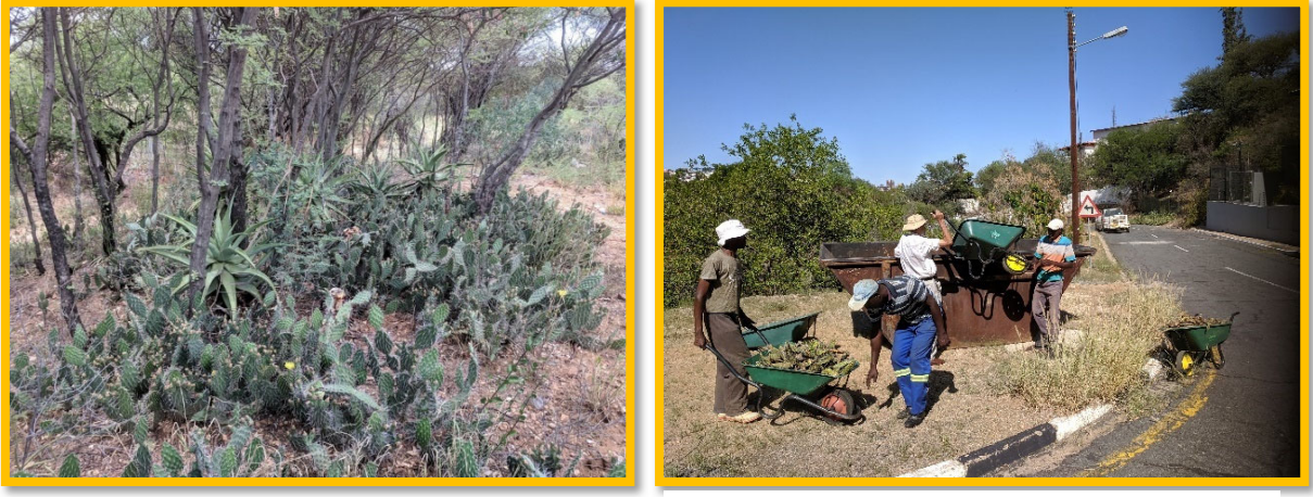
Aloes losing their habitat. Photo by G. Voigts.

Invasive cacti are taking over habitats of native vegetation and spreading throughout Namibia at an incredibly rapid pace.