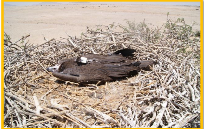
Chick with satellite tracker.

All six vulture species still found in Namibia are existing under pressure from several sources, with poison being the number one killer. Like vultures throughout Africa and other parts of the world, vultures continue to decline in numbers. In Namibia, the status of vultures, as defined by the International Union for conservation of Nature (IUCN), is as follows: