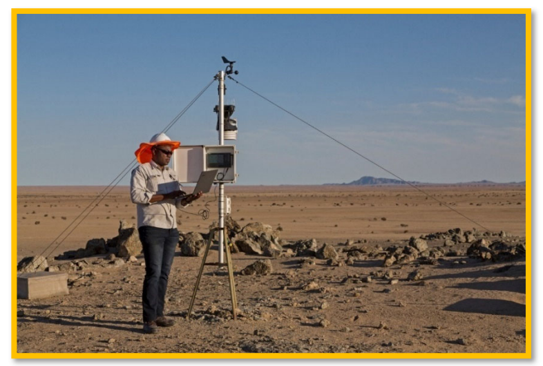
Weather data collection.

A weather station is maintained in the project area and this has been operating since 2010. A new weather station was installed in July 2019 and weather continues to be downloaded monthly. Data will provide a baseline for modelling local weather including dust and radon predictions.