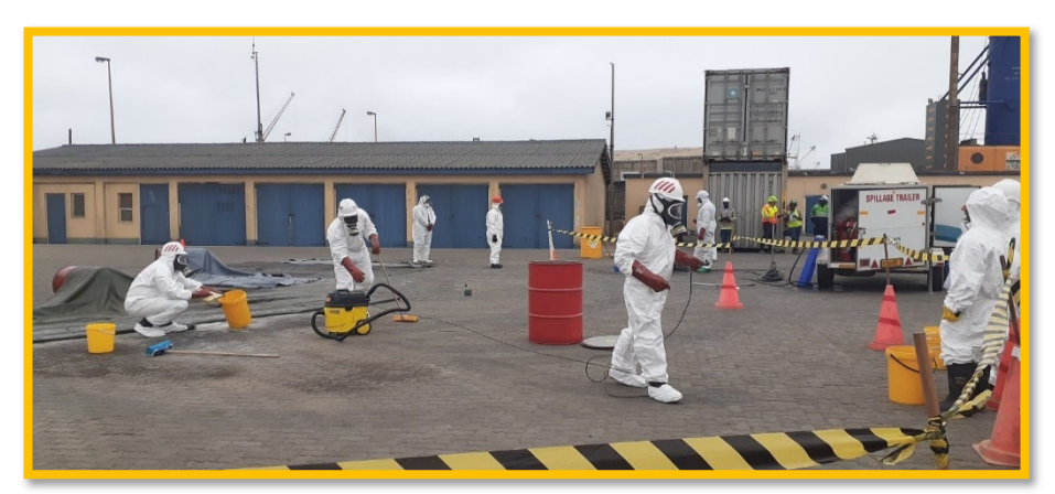
Uranium spill simulation training.

February 2020. In RMR participated in an emergency drill in Walvis Bay simulating a uranium concentrate spillage. All local uranium companies participated, followed by a debrief. This emergency simulation is an annual event.