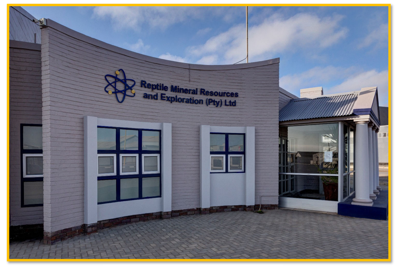
RMR's office premises, Swakopmund, Namibia.

As the Group moves forward through the development process in Namibia, all aspects of ESG will be monitored and reported, with an ongoing focus on operating in an open and transparent manner.