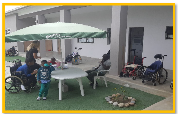
C.H.A.I.N. day care centre.

Based in Swakopmund, it is currently looking after 20 handicapped children (mainly down syndrome and cerebral palsy), 3 to 12 years of age.