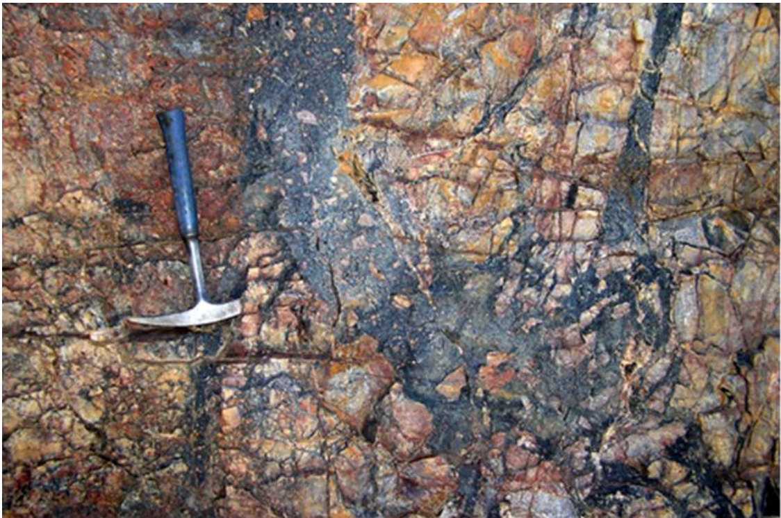
Magnetite-cemented hydrothermal breccia veins along fault zone at Yamamilla South