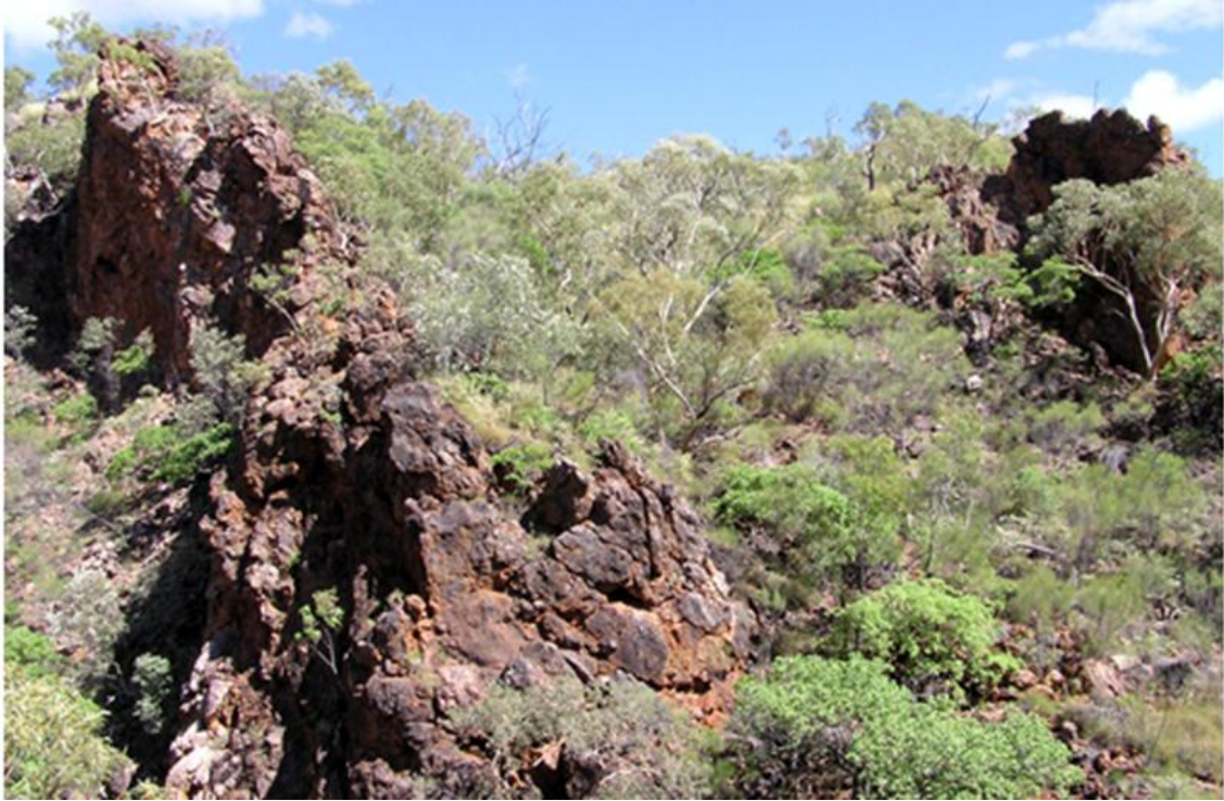
Ironstone Breccia Ridges at YM-8