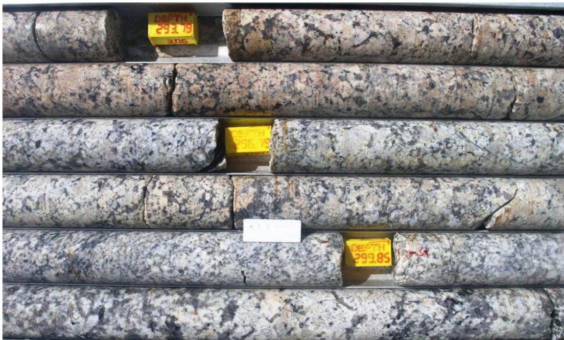
Figure 3: Hole ALAD1455 – Mineralised Coarse Grained to Pegmatoidal Alaskite (294 to 301 metres downhole)