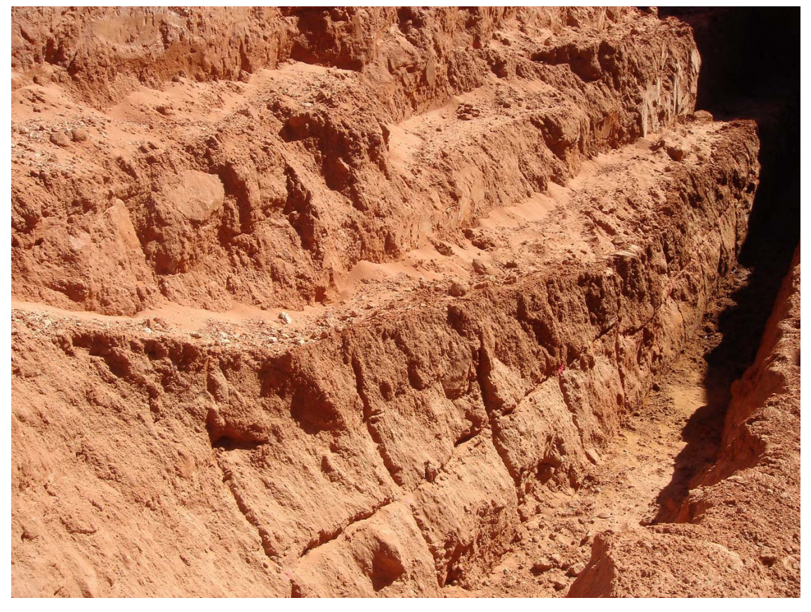
Tubas: Entire area exposed is mineralised red sand - final cut 10 - 11 m depth