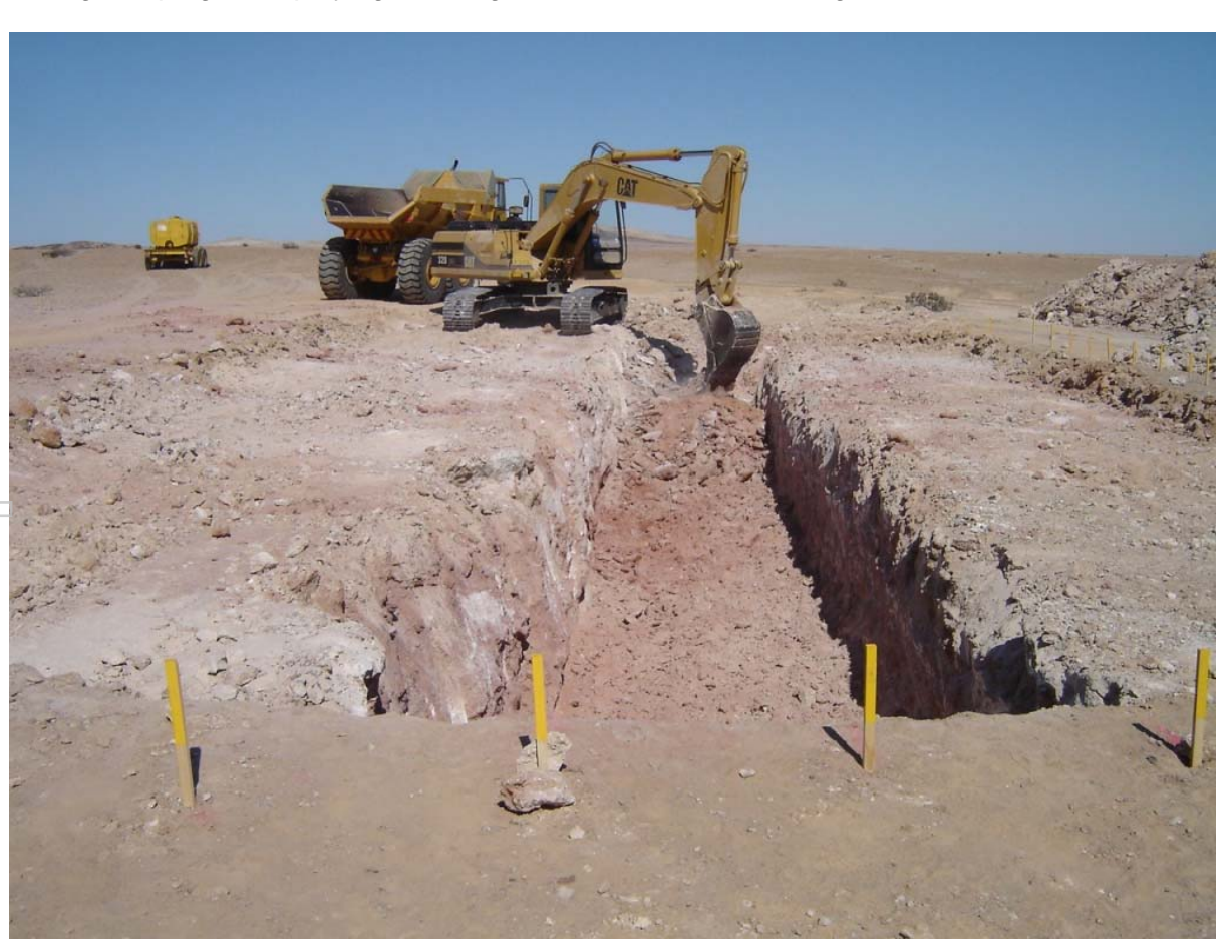
Tubas: Start of trench through surface gypsum layer

In detail the trench was 20 metre long at its planned terminal depth of 10 metre and in part was excavated to 11 metre as it was not possible to penetrate the hard calcrete base. The attached photos portray the 2 metre benched construction of the trench. The walls of each cut and its floor was channel sampled on one metre block patterns. This generated in excess of 4,000 samples that will take two to three months to assay, as priority is being given to samples from the ongoing drilling campaigns employing 6 RC rigs and one diamond drill rig.