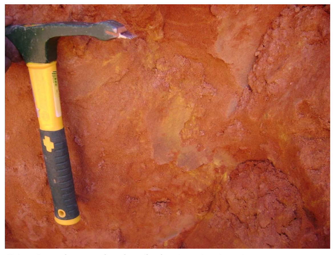
Tubas: Pervasive carnotite mineralisation through red sand