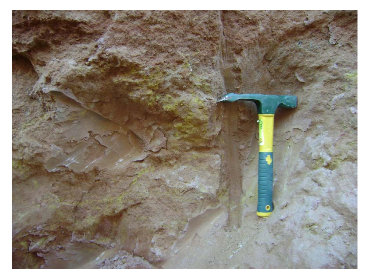
Tubas: Coarse carnotite accumulations in mineralised sand 2-4 m depth.