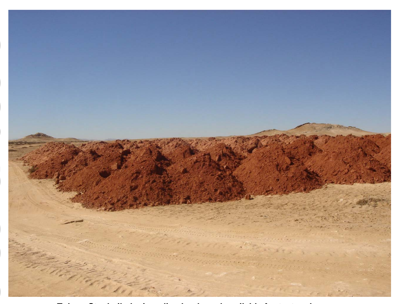
Tubas: Stockpiled mineralised red sand available for testwork

It is yet to be confirmed but it appears there is little or no uranium mineralisation in either the overlying gypsum or any of the calcrete within and below the sand.