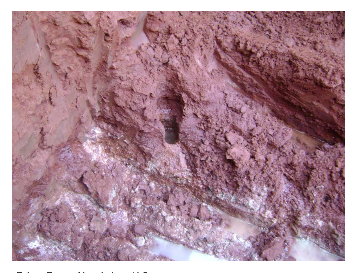
Tubas: Trace of borehole at 10.5 metre