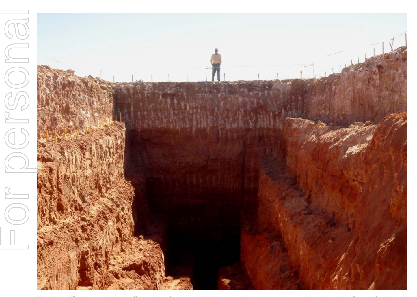
Tubas: Final trench profile showing upper gypsum layer 0 - 2 m depth and mineralised red sand to the bottom of trench.

Of note is that the average assay value for the complete section is 1,296 ppm U_3O_8 over 10 metre from surface using no cut-off. Applying a 100 ppm cut-off this value becomes 1,430 ppm U_3O_8 over 9 metre. Applying a 200 ppm cut-off this value becomes 1,590 ppm U_3O_8 (sand only).