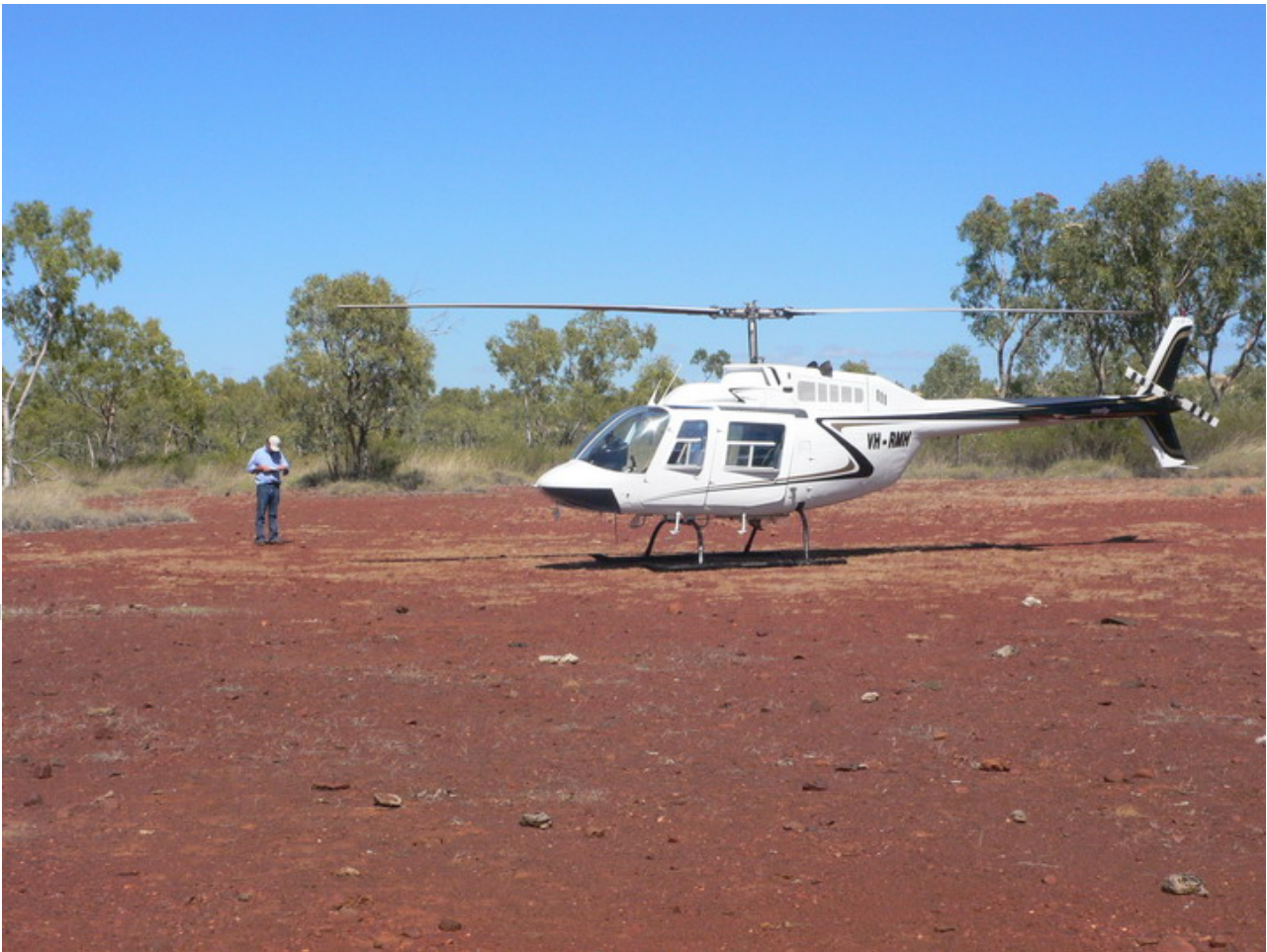
Crystal – 1 Prospect. Highly anomalous haematitic soils over siltstone. Samples DH 017 and 018 site.

Within EPM 14281 uranium mineralisation is hosted by chloritic shear zones developed through granite. The Miranda North Prospect is located 450 metres north of the DYL's Miranda Prospect. RC percussion drilling will commence on the existing Miranda and Miranda Northwest Prospects within EPM 14281 in mid-October and will then test the new Miranda North Prospect prior to moving to EPM 14916.