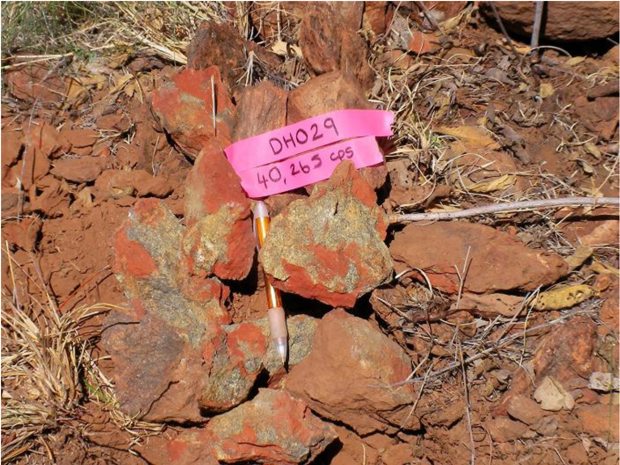
Miranda North Sample DH 029. Oxidised chlorite–haematite schist with pale yellow uranophane (?) mineralisation