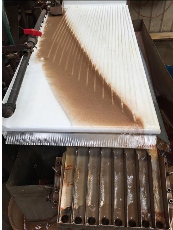
Figure 3: Wilfley Table Test

The results achieved to date in the de-sliming and carbonate removal process are highly encouraging.