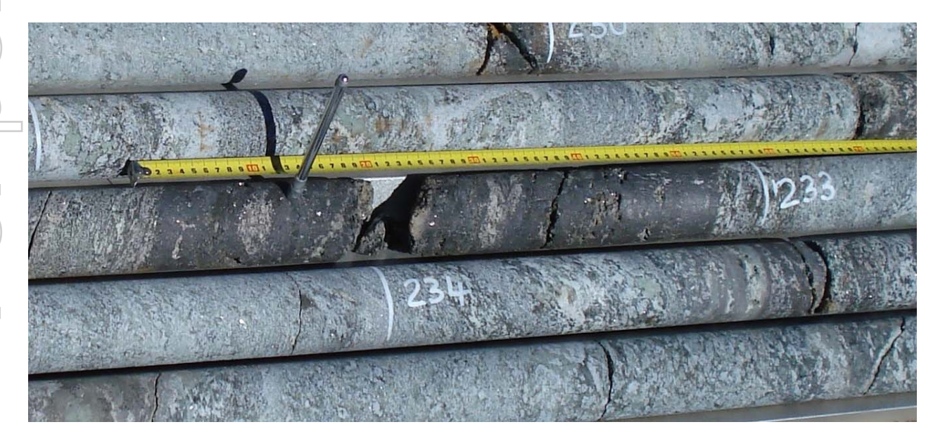
Figure 2: Diamond core from hole INCD7 showing massive highly mineralised magnetite, brecciation and alteration.

There are no chemical assays available for the diamond hole INCD7 (or the six earlier drilled diamond holes) as the core is yet to be cut and assayed. What is becoming clear (and observed in surface assays from the discovery of INCA) is that the gamma radiation (or equivalent uranium written as eU<sub>3</sub>O<sub>8</sub>) underestimates the amount of chemical uranium (cU<sub>3</sub>O<sub>8</sub>) present in massive magnetite and this phenomenon is being attributed to the fact that the presence of dense massive magnetite (as can be seen in diamond core in Figure 2) may reduce the natural radiation to such an extent that its presence causes the observed difference between the eU<sub>3</sub>O<sub>8</sub> and the cU<sub>3</sub>O<sub>8</sub> values. The reported eU<sub>3</sub>O<sub>8</sub> for mineralisation found in massive magnetite may therefore be underestimating the actual amount of uranium present and more work is required to quantify this masking effect. Assays of the diamond core will assist in better understanding this effect.