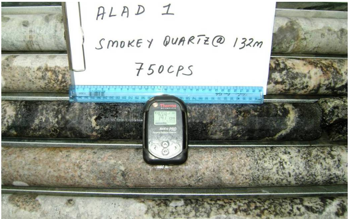
Uraniferous Ongolo Alaskite showing smokey quartz alteration

The Ongolo mineralisation comes to within 20 metres of surface and underlies a broad, flat gently sloping sheetwash plain thinly veneered by gravelly alluvial and aeolian sands. The enclosing rocks are mostly pelitic gneiss with variable but significant pyrite/pyrrhotite content, which may be important if sufficient to be recovered to support locally generated sulphuric acid production. The uranium mineral is primarily uraninite, and where present at grades of greater than 500 ppm, is marked by the presence of significant visible smokey quartz and, frequently, biotite.