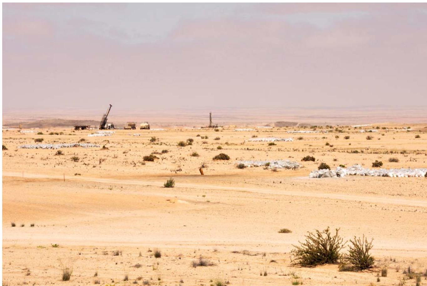
RC Drilling at Ongolo Alaskite Project – January 2011

For further information regarding this announcement, contact: