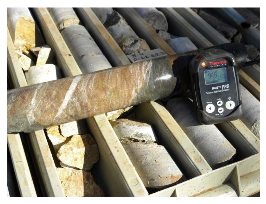
High Grade Mineralisation with intense alteration – Hole TGDC001