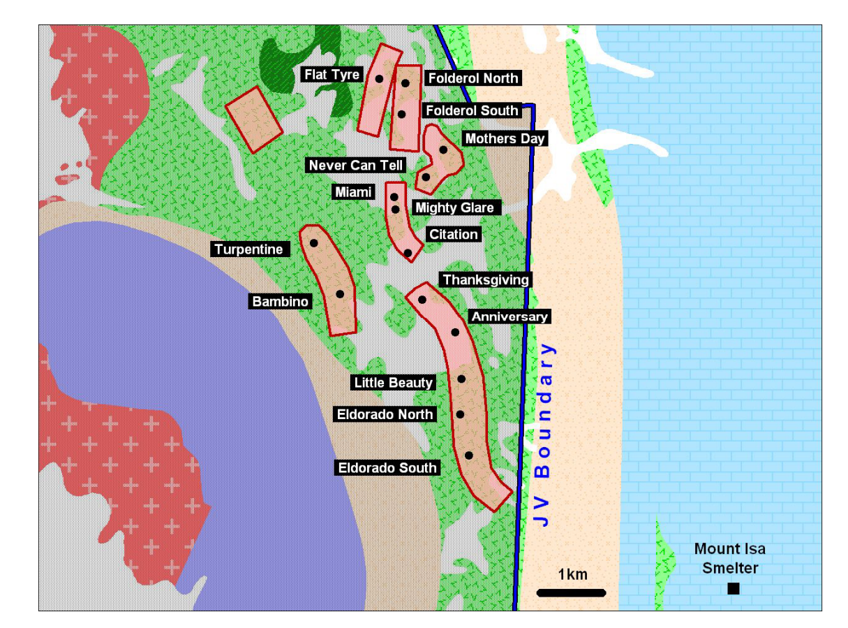
Figure 2: Isa West Prospects