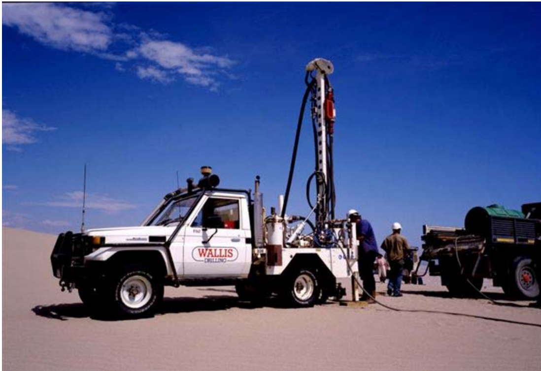
Mantis 75 Aircore

The two Wallis rigs will replace two (2) RC rigs which together with the four (4) remaining RC rigs will continue drilling at the rate of 15,000 to 20,000 metre per month.