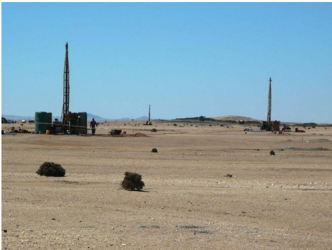
Figure 4: Drill Rigs at INCA