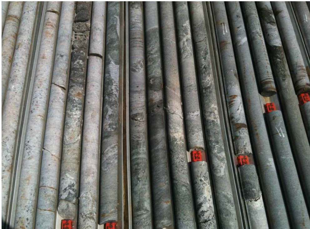
Figure 3: Typical Core Samples at INCA