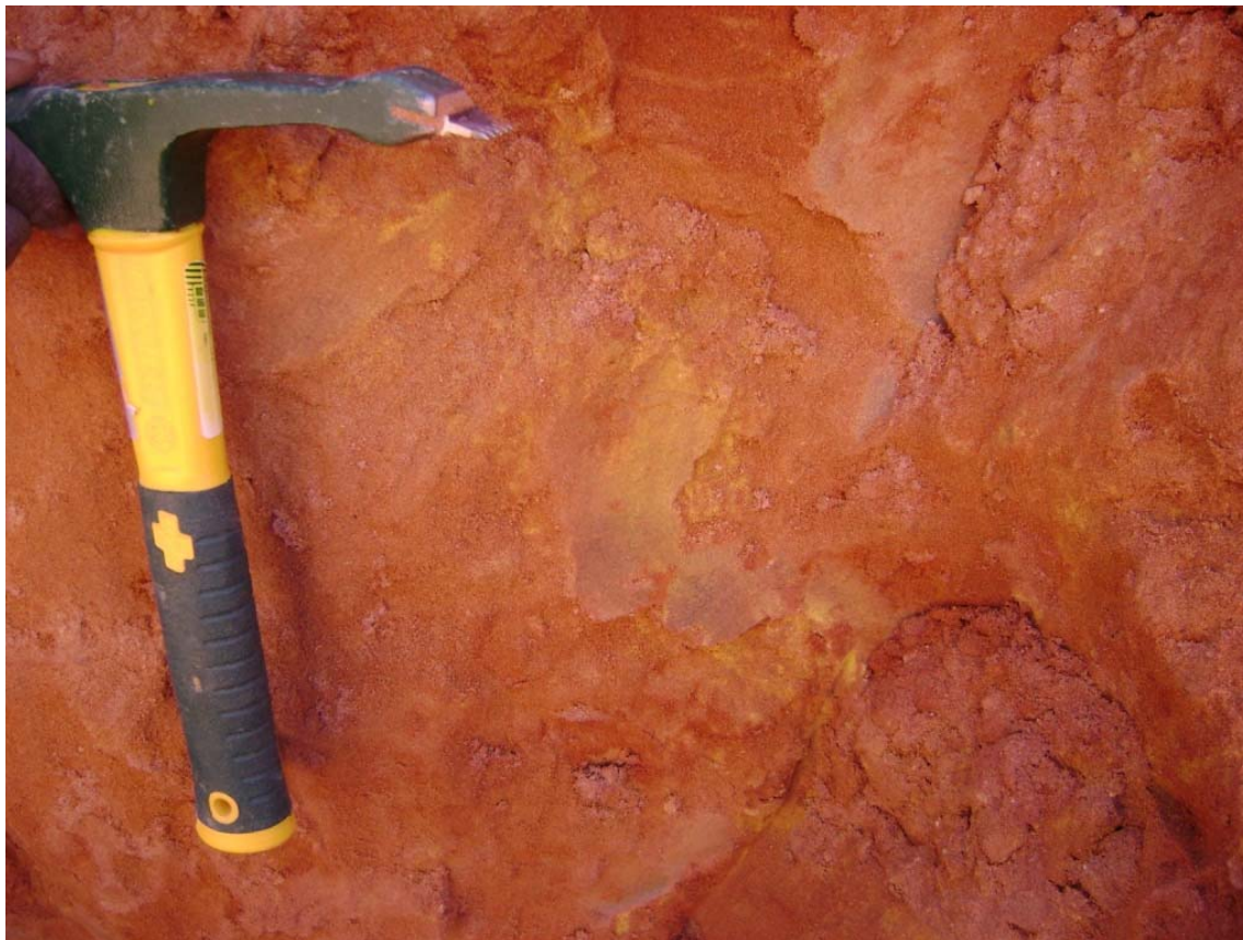
Tubas: Pervasive carnotite mineralisation through red sand