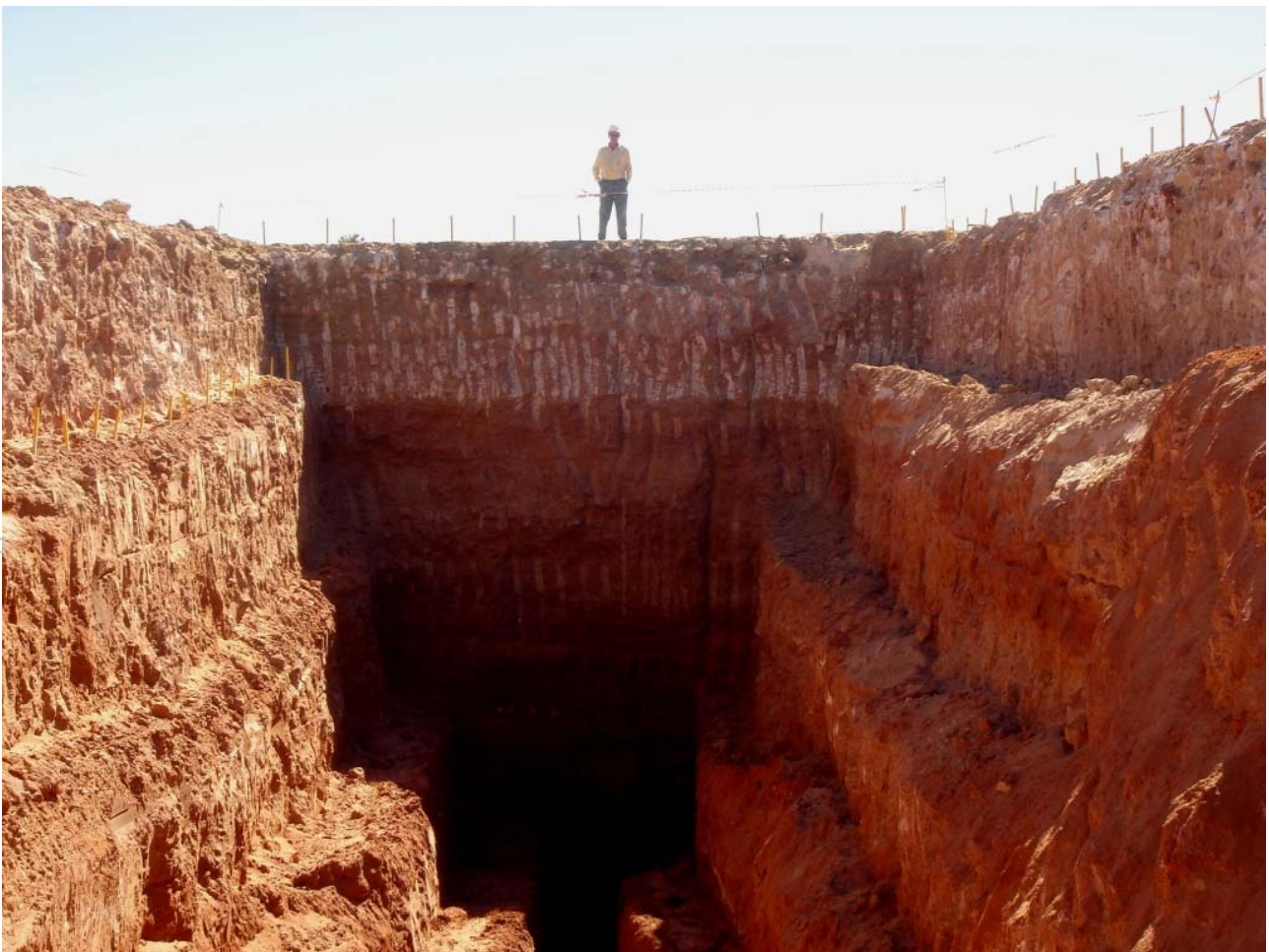
Tubas: Final trench profile showing upper gypsum layer 0 – 2 m depth and mineralised red sand to the bottom of trench.

Of note is that the average assay value for the complete section is 1,296 ppm U 3 O 8 over 10 metre from surface using no cut-off. Applying a 100 ppm cut-off this value becomes 1,430 ppm U 3 O 8 over 9 metre . Applying a 200 ppm cut-off this value becomes 1,590 ppm U 3 O 8 (sand only) .