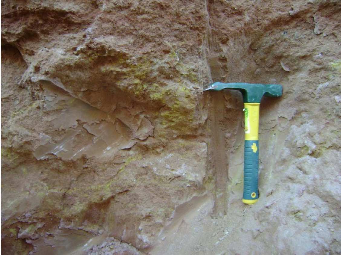
Tubas: Coarse carnotite accumulations in mineralised sand 2-4 m depth.