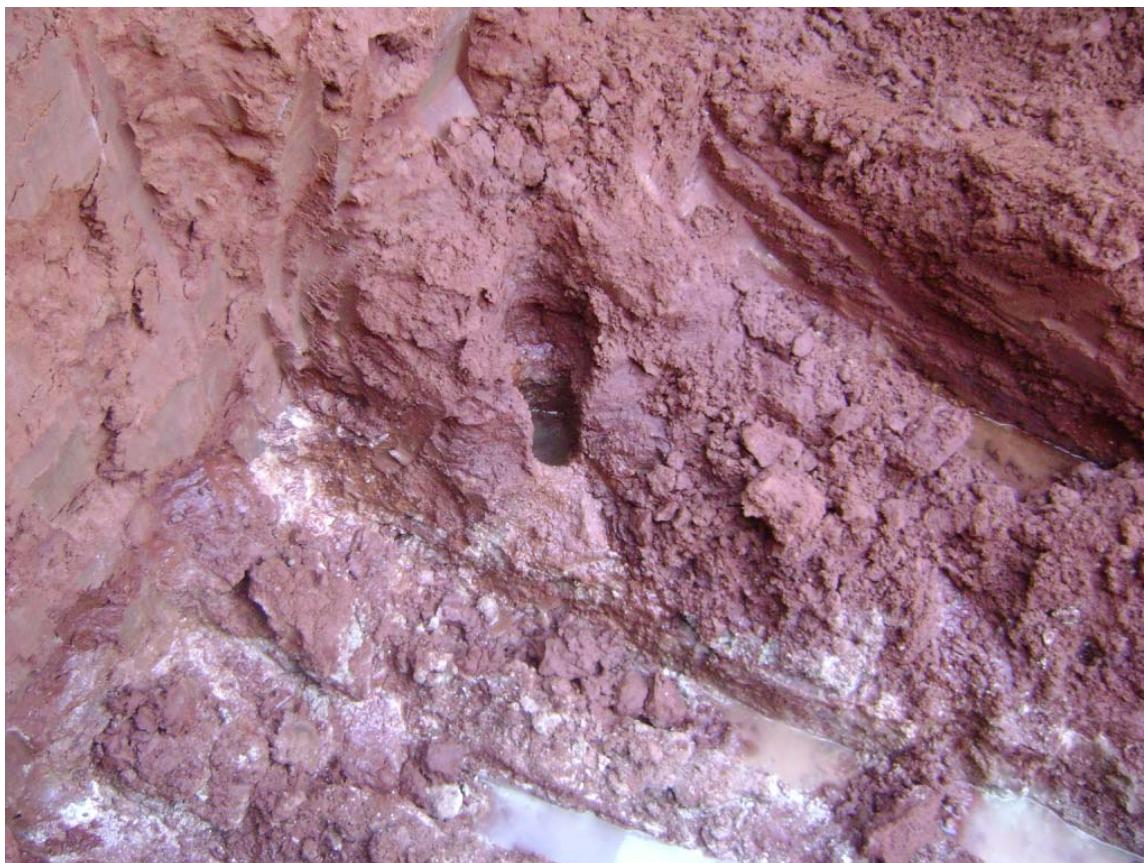
Tubas: Trace of borehole at 10.5 metre