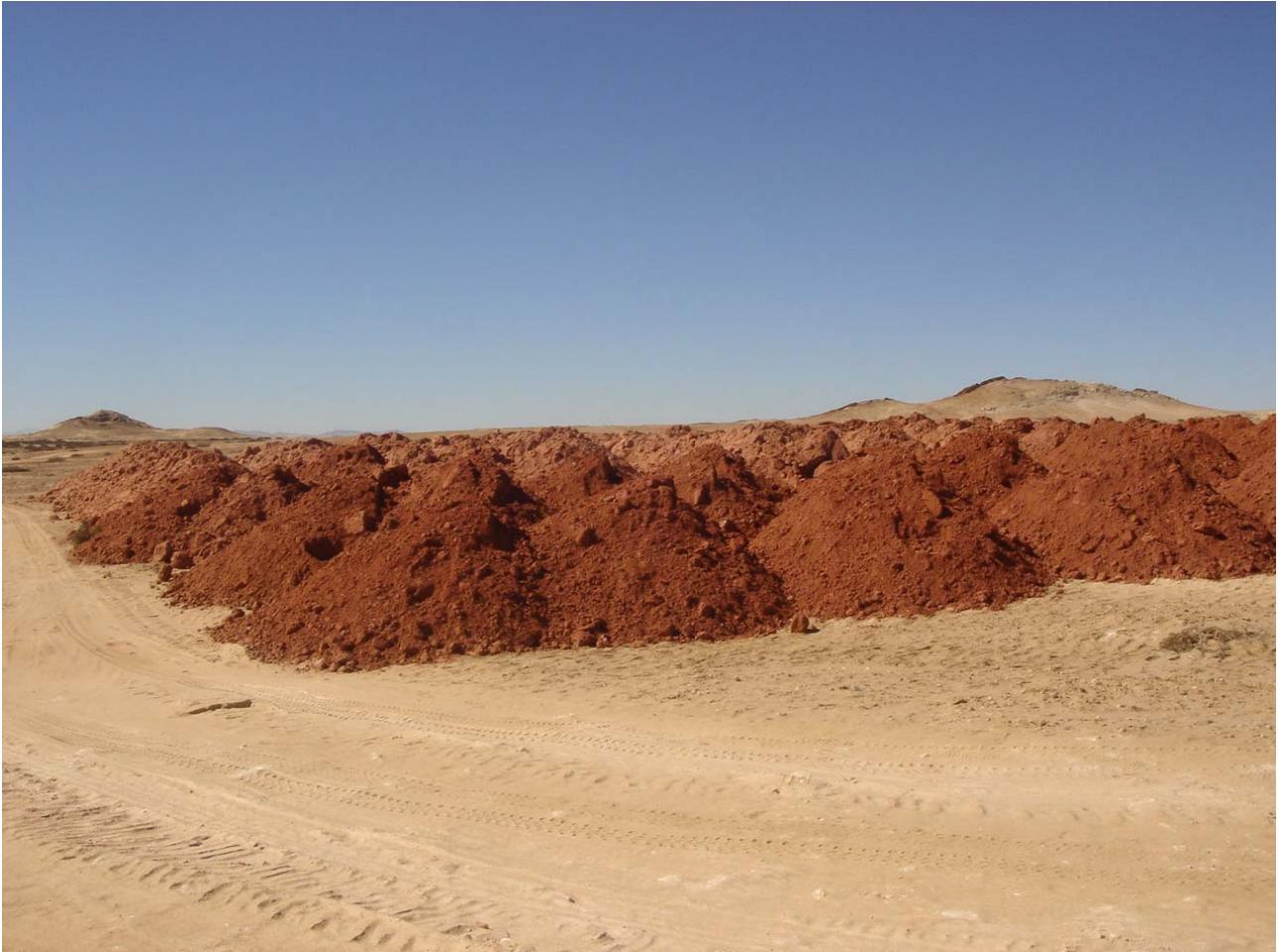
Tubas: Stockpiled mineralised red sand available for testwork

It is yet to be confirmed but it appears there is little or no uranium mineralisation in either the overlying gypsum or any of the calcrete within and below the sand.