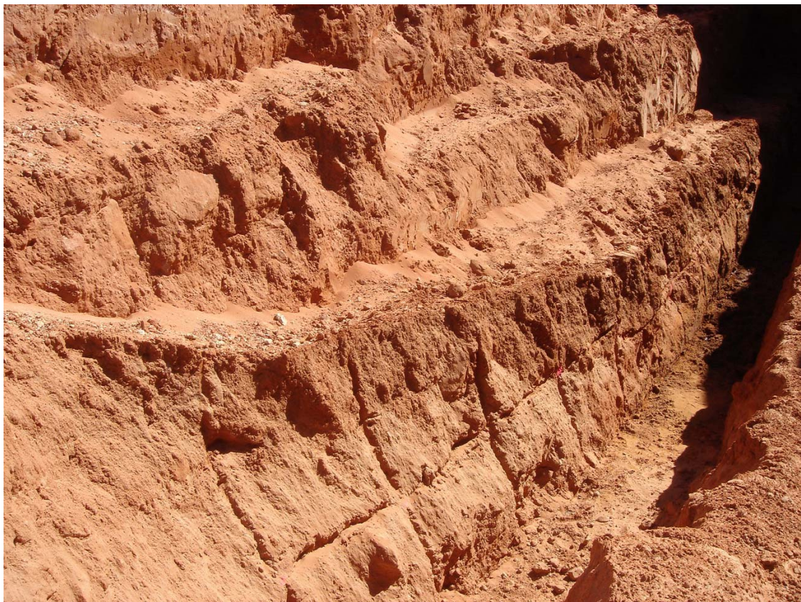
Tubas: Entire area exposed is mineralised red sand – final cut 10 - 11 m depth