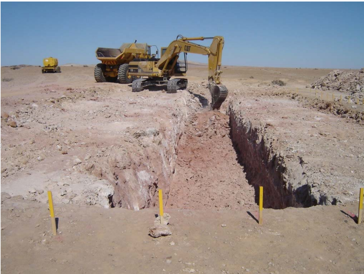
Tubas: Start of trench through surface gypsum layer

In detail the trench was 20 metre long at its planned terminal depth of 10 metre and in part was excavated to 11 metre as it was not possible to penetrate the hard calcrete base. The attached photos portray the 2 metre benched construction of the trench. The walls of each cut and its floor was channel sampled on one metre block patterns. This generated in excess of 4,000 samples that will take two to three months to assay, as priority is being given to samples from the ongoing drilling campaigns employing 6 RC rigs and one diamond drill rig.